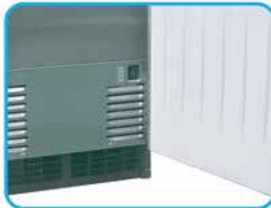
Power switch at the bottom right when the door open