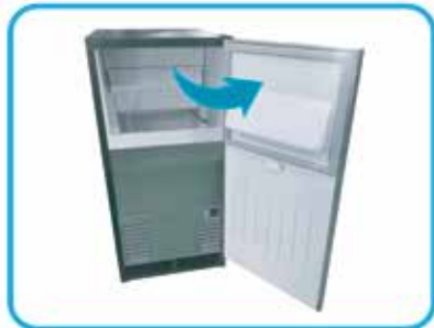
Easy to scoop Ice