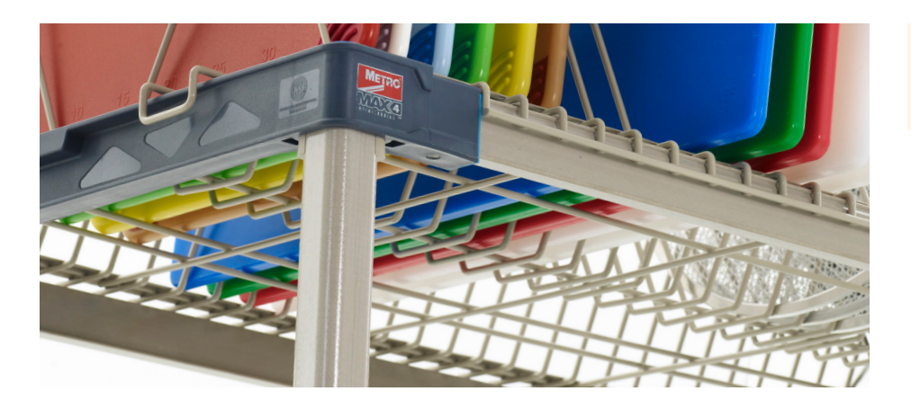
Tip: Convert a MetroMax 4 shelf to an open frame by removing the shelf mat sections.