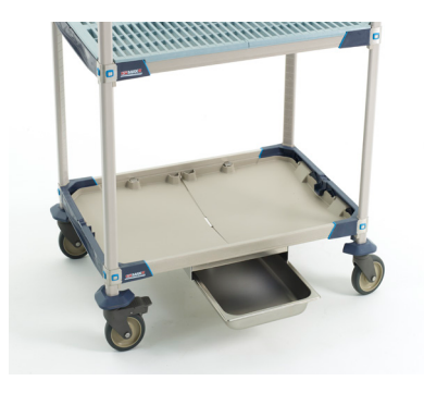
Drip Tray Mounted to a MetroMax i 24x36" (610x914mm) Frame. Steam Pan not included.