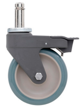
5PCBM Antimicrobial Tread Swivel Brake