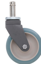
5PCM Antimicrobial Tread Swivel